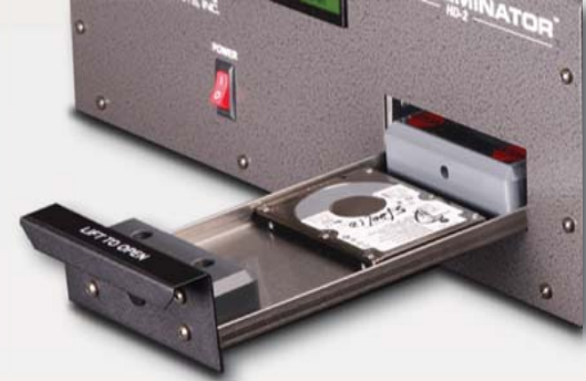
Laptop Hard Drives