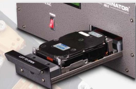
1.5" Hard Drives

Note: Hard Drives and some tapes are not reusable after having been erased with the HD-2.