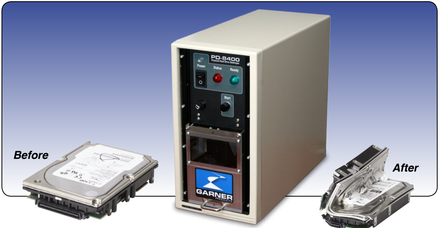
Hard Drives before and after destruction

The PD-8400 physically destroys hard drives by bending, breaking and mangling the hard drive and its internal components including the data platters. The data platters are bent and separated from the hub, the hard drive housing is cracked, the PC board is broken and the read/write heads are mangled.